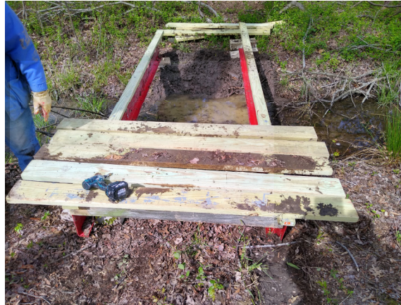
Place a few deck planks

And Voila ! Theodore Bridge. Actually needs a few more screws and of course abutment ramps.