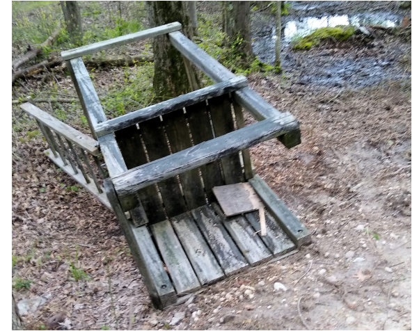
Tomorrow's Project – The Lookout Tower

And Voila ! Theodore Bridge. Actually needs a few more screws and of course abutment ramps.