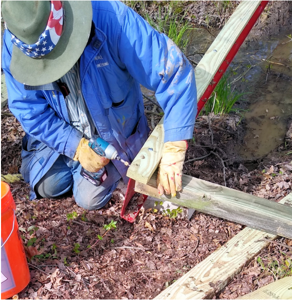
Grampa Drives the Timberlock through the predrilled web hole and into the end of the PT 4x4 cross strut.