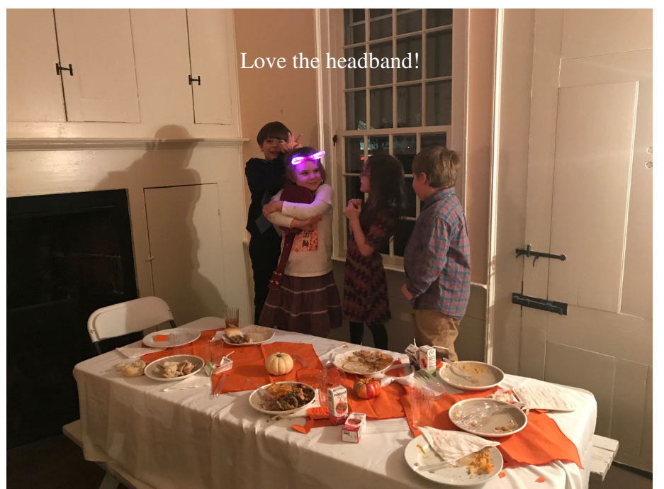
Love the headband!