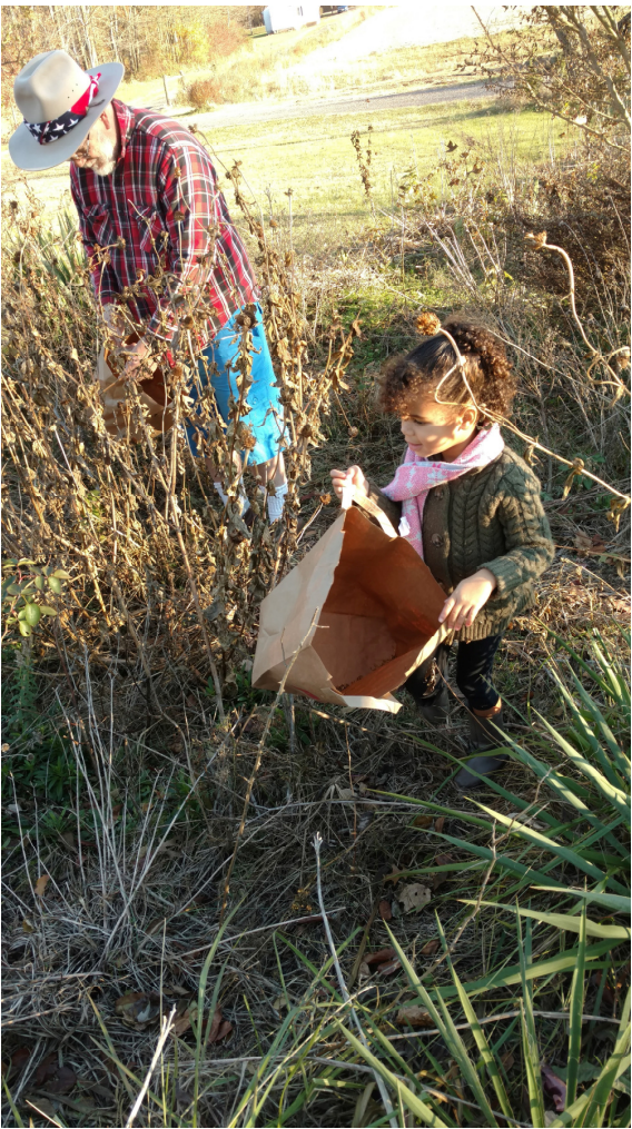
Lila and Grampa collect zinnia seeds.