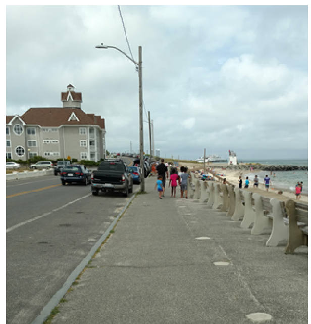
Martha's Vineyard, July, 2018