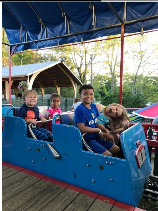
Quassy Amusement Park and Waterpark, Middlebury, CT.