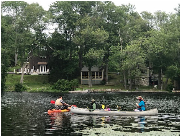
Canoeing on the lake, Middlebury, CT.

There was lots of travel during the summer of 2018! Families went to Deer Island, France, Falmouth, MA, Martha's Vineyard, Turks and Caicos, New York City, Connecticut, Maine, Providence, Washington, DC, Kinderhook, NY and probably some places I haven't mentioned (sorry if I left something out). The Incredible Cousins also attended a variety of camps. A busy summer!