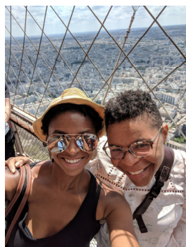
Eiffel Tower, Paris