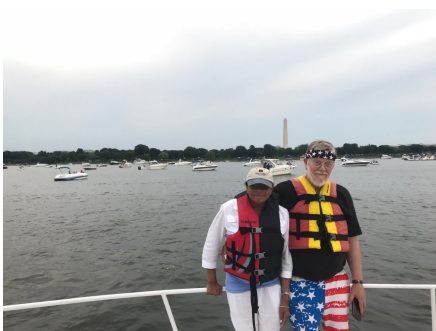
4 th of July fireworks on Hōkūle'a, Washington, DC