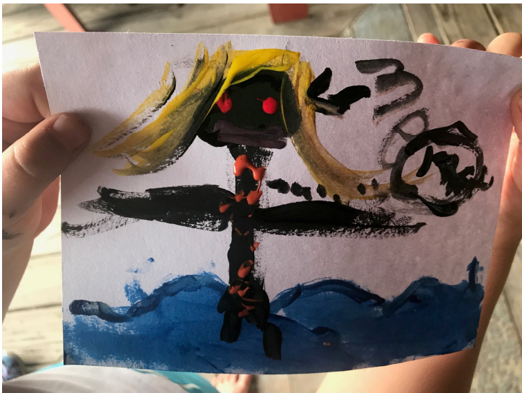
“Swimming in the waves at Deer Iland” by Gigi